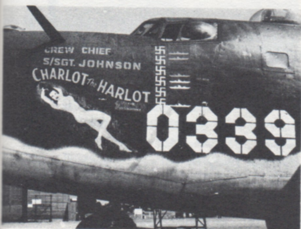
Charlot the Harlot, 42-40339, a B-24D-50-CO. She began her war with the 480th Antisubmarine Group and ended it as a trainer at Peterson Field, Colorado, in 1944.