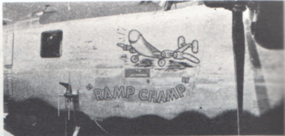
Ramp Champ, 44-41996, a B-24M-10-CO. This black-bellied ship flew with the 3rd Photo Recon Squadron from the Marianas in June 1945, as a part of XXI Bomber Command.