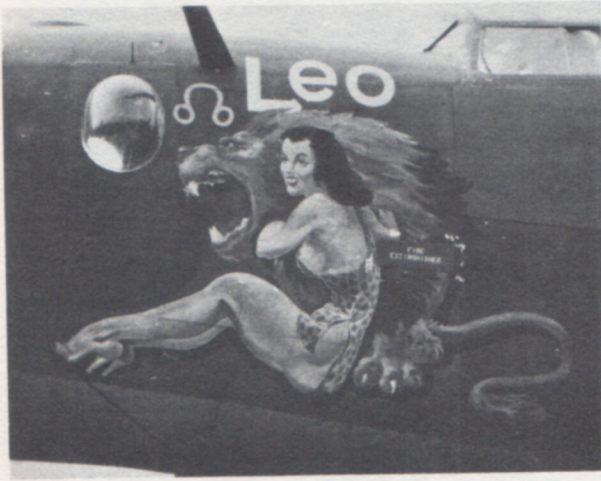
Leo, 41-29605, a B-24H-15-FO from the Zodiacs, the 834th Squadron of the 486th Bomb Group. The other eleven planes in the unit were decorated with equally liberal interpretations of the stars.