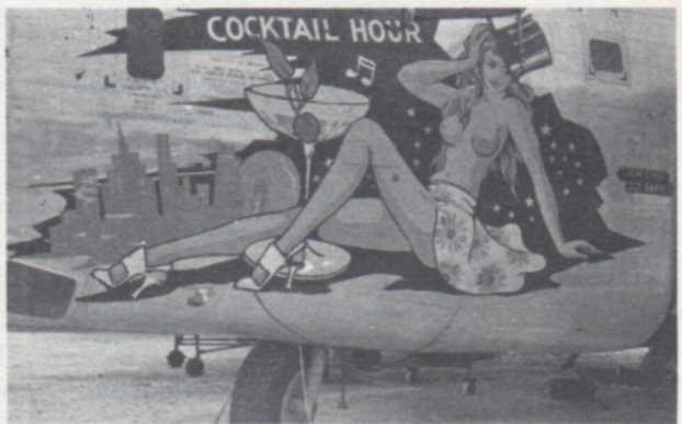
Michigan, 44-40429, and Cocktail Hour, 44-40428, both B-24J-161-COs from the 43rd Bomb Group. Their billboard decorations were painted by the greatest combat artist of the war.