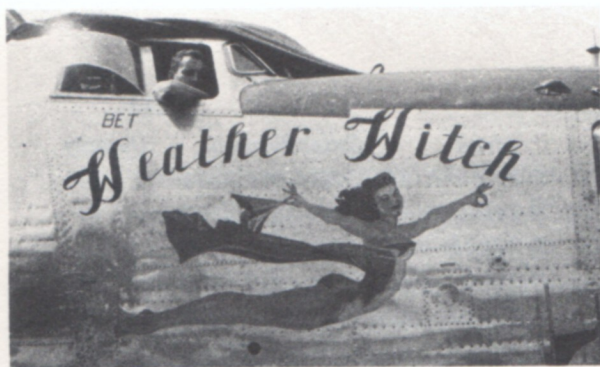
Weather Witch, a B-24L-11-FO specially modified for the 55th Recon Squadron (long Range Weather) and based on Guam.