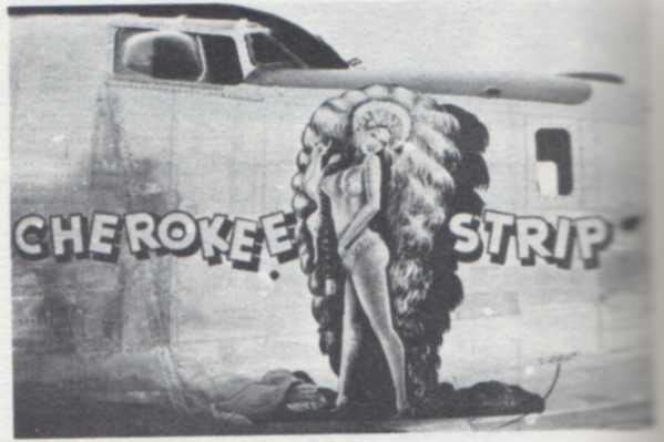
Cherokee Strip, an F-7B from the 20th Combat Mapping Squadron; this model differed from the F-7A by having all its six cameras located in the bomb bay. (E. P. Stevens)